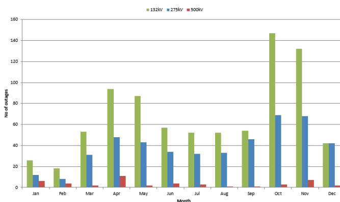
Figure 2. Transmission line outages due to lightning in peninsular Malaysia (from 2002 – 2015)

In evaluating overhead line performance, a list of available standards such as IEEE Std. 1410 an IEEE Std. 1243 can be used. However, it is always a challenge for users from the tropical countries as these standards and procedures are generally designed to be used in non-tropical countries such as United States of America, Canada and Europe (Baharuddin, Abidin, & Hashim, 2006). A recent work by CIGRE WG C4.410 specified calculated on high voltage line performance ranging from 4.7 to 4.9 flashes per km 2 per year which are incomparable to the GFD value in tropical countries which typically are between 10 and 30 flashes per km 2 per year (See Table 3).