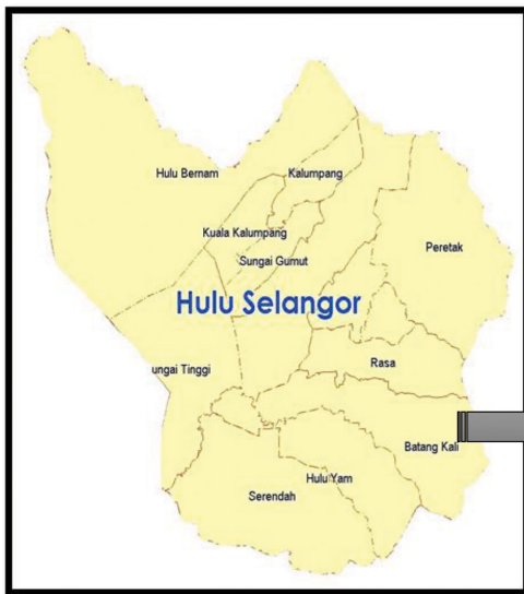
Figure 1. Map showing Hulu Selangor, Malaysia

The collected seeds were tested for viability in the laboratory using paper towels and distilled water in Petri dishes and placing the Petri dishes in a seed germinator at 27°C for seven days. The data then collected were tabulated for statistical analyses using the Statistical Package for the Social Sciences (SPSS) (Landau & Everitt, 2004, pp. 339). Analysis of variance (ANOVA) of the data was determined to discover the significant differences between the means. The Duncan New Multiple Test was used to indicate the significant difference between the treatment means.