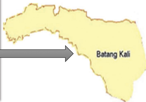
Figure 2. Sampling area at Batang Kali