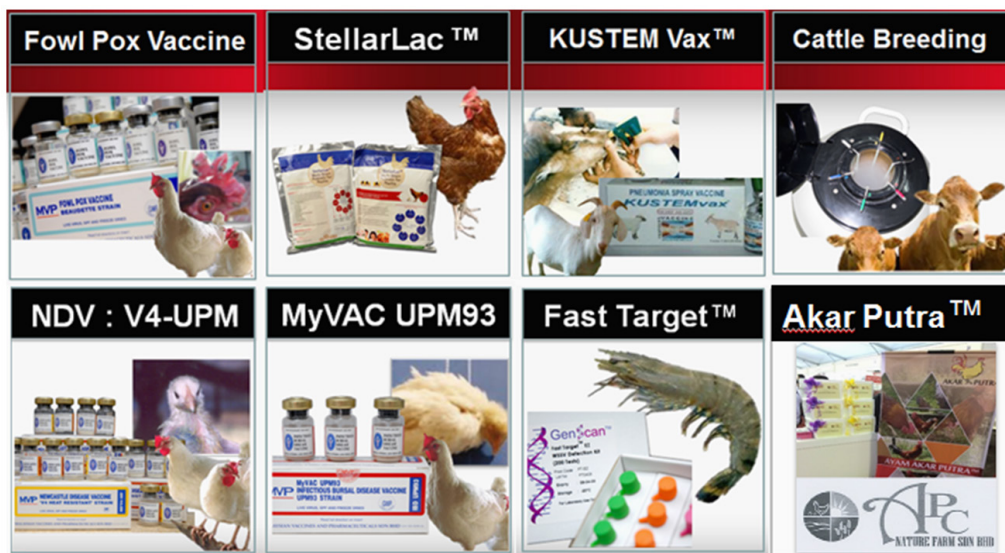
Figure 2. Example of commercial products derived from research activities conducted in UPM

in the agricultural field have improved the quality of agricultural practices in Malaysia. There are many examples of useful research output for agriculture applications. One of the most significant commercial products produced by UPM researchers is NDV:V4-UPM vaccine (Figure 2) for Newcastle disease which was recorded back in 1993 (Aini et al., 1990; Aied et al., 2011). A drastic increase in the mortality rate of poultry was observed following Newcastle disease virus infection which resulted in a serious drop of income level. An example of potential use of research output for agriculture application in the field is the use of virus that is non-pathogenic to humans for development of a biological control agent to control wild rat populations that have caused massive losses to rice growers (Loh et al., 2003; Loh et al., 2006). Interestingly, biological materials that resulted from extensive animal research were also used to safeguard human health