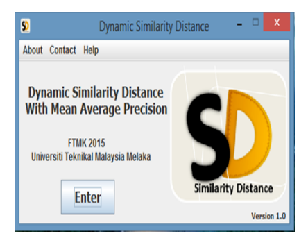
Figure 1 . First interface of SD tool

The Dynamic Similarity Distance with Mean Average Precision (SD Tool) was proposed. It applied six types of distance methods, namely Euclidean, Manhattan, Canberra, Sorensen, Chebyshev and Angular Separation. This tool is dynamic because it is flexible to be applied to any different length of features and is also compatible with large database. Both train and test data can be any length of features (column) but the size of train and test data must be in the same length. However, this proposed tool only accepts the format of Comma Separated Value (CSV) file and applicable in digit or numeric form for both test and train data. The ranking measurement uses Mean Average Precision (MAP) in order to increase the results of similarity distance's accuracy. Figure 1 shows the first interface of SD tool while Figure 2 shows the interactive interface that contains file section, filter section, result section, ranking section and several buttons.