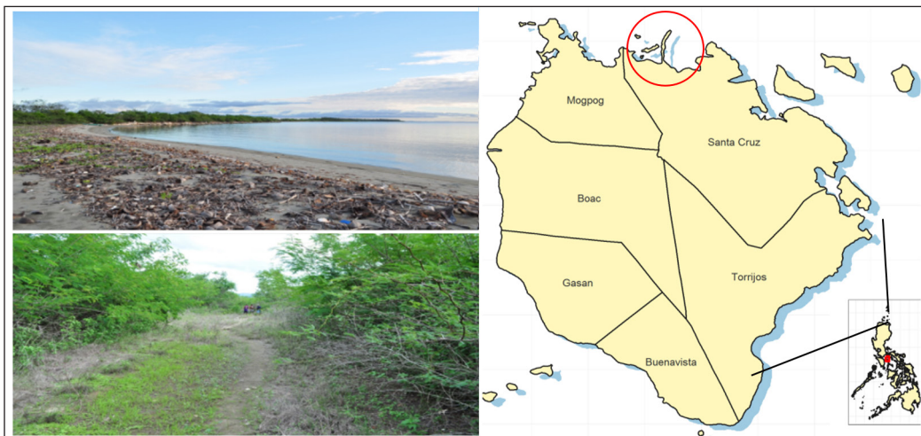
Figure 1. Map of Marinduque, its location (inset) and the study site (encircled red) ( https://www.r-bloggers.com/creating-inset-map-with-ggplot2/ )

Marinduque, an island province located 137 miles south of Manila is an ideal area to study heavy metals. The island located south of mainland Luzon only measures 172,700 hectares and is composed of six townships namely Boac, Gasan, Buenavista, Torrijos, Sta. Cruz, and Mogpog. In the municipality of Sta. Cruz, an eight-kilometer causeway was created from the mine tailings dumped in the vicinity of Barangay Ipil along Calancan Bay. The island province is also rich in biodiversity. In fact, seventy-five species of birds were observed in the island, of which, seventeen are endemic to the country and six are island endemic subspecies (Gonzalez & Dans, 2000). The possibility of detecting more species of birds in the said area is high as Sanchez (2015) captured some species that were not recorded in books such as by Kennedy et al. (2000).