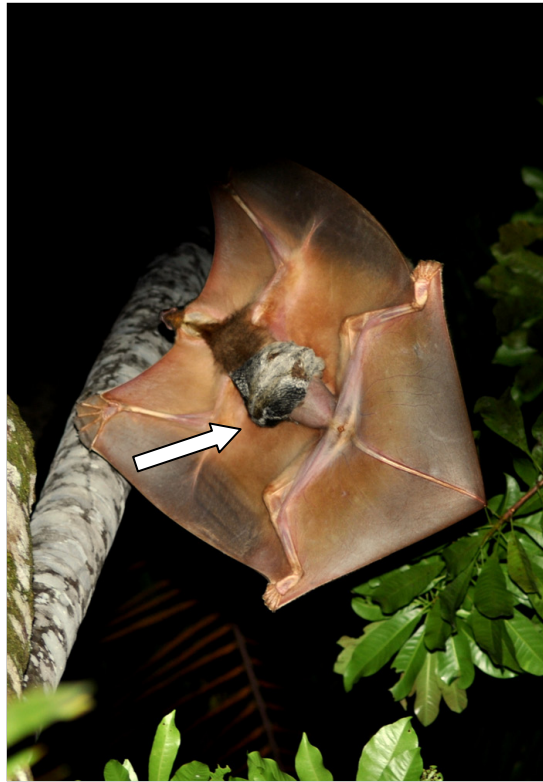
Fig.3: An infant can be evidently noticed on the female Colugo and this differentiated between the two female Colugo individuals (Fig.2)