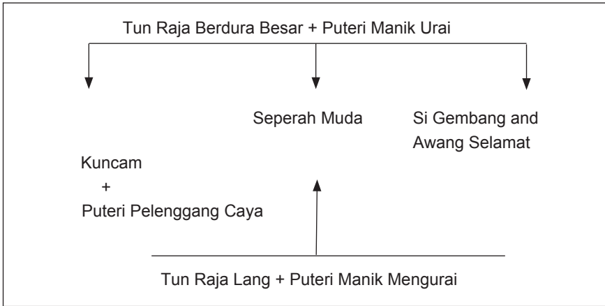
Figure 1 The Relationship between the characters in the Hypotext Si Gembang.

The author employs the technique “flashback” in this episode as is evident on pages 13–14,