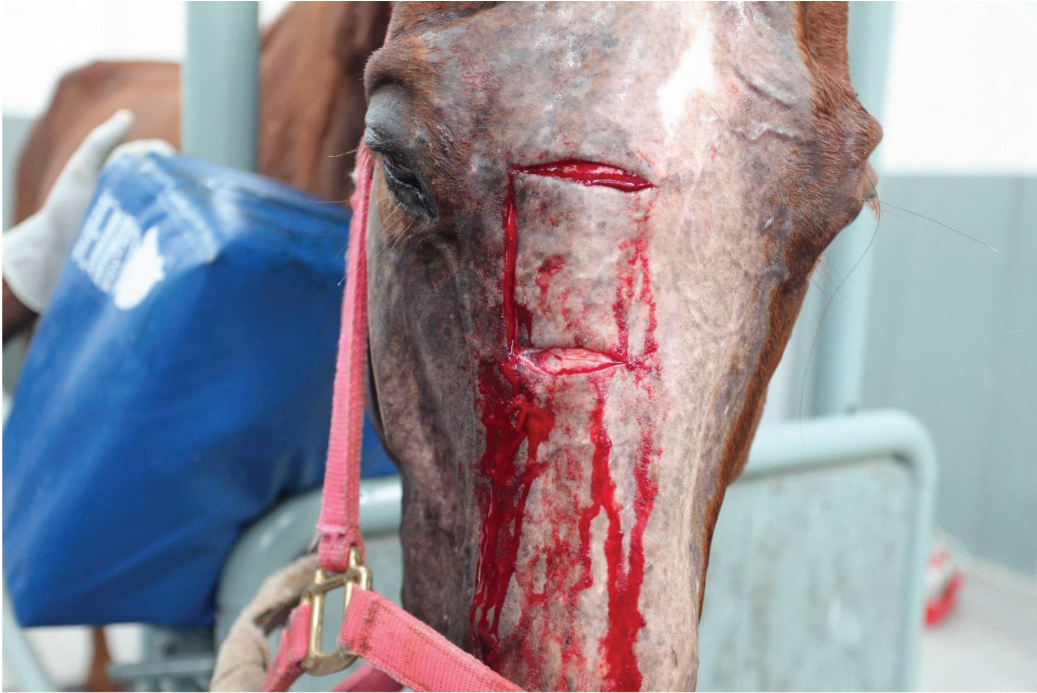
Fig.4: Skin incisions, extending through subcutaneous tissue and the periosteum were made along the rostral, lateral and caudal margin for the boundaries of the frontonasal bone flap.

samples of the necrotic materials from the sinus compartments were taken for further diagnostic testing. Samples were submitted for bacterial culture and sensitivity testing and cytological examination. Cytology was requested to rule out the presence of neoplastic cells. The paranasal sinus compartments were then explored and all necrotic tissues and purulent material were removed using fingers, curette and haemostat. Copious lavage using a hose with tap water was directed into the sinus opening to thoroughly dislodge any inspissated pus, necrotic tissue and haemorrhage. This procedure was tolerated well by the horse and provided us with an opportunity to thoroughly clean all the sinus compartments. For closure, the bone flap was replaced, and