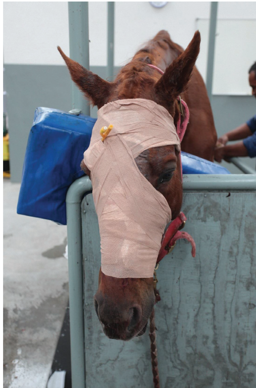
Fig.7: The surgical site was bandaged post-operatively.

infestation. Bandage was changed every three to five days. By the third day of daily sinus lavage, nasal discharge from the nostril had stopped. Thirty days from the day of the operation, the wounds were progressively healing on both surgical sites without any complication.