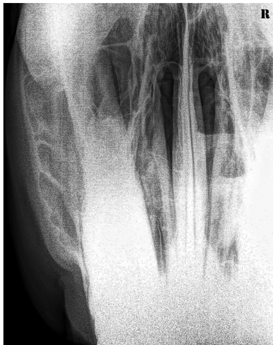
Fig.3: Dorsoventral view of the paranasal sinuses. The fluid lines noted on lateral view were confined to the right side.