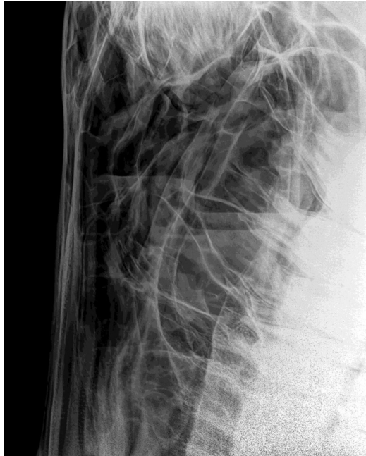
Fig.2: Right lateral view of the paranasal sinuses. The ethmoid region was normal in radiographic appearance, but there are multiple fluid lines in both the frontal and maxillary sinuses.