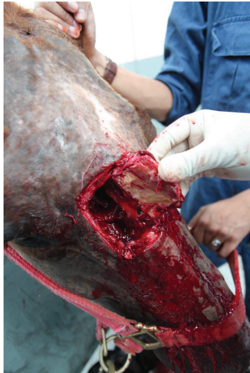
Fig.5: The frontonasal bone flap was created, exposing the frontal sinus and maxillary sinus compartments.